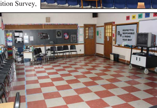
The auditorium (above) and chorus room (left) will be renovated as part of the proposed project.

as required by the New York State Department of Education to ensure school districts are planning for and maintaining their facilities. This plan outlines a scope of work which, among other things, replaces items giving way to years of normal wear and tear. The proposal includes